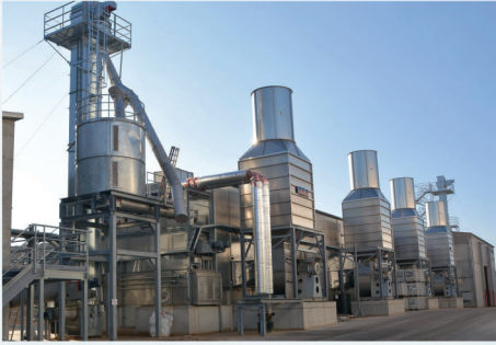
Biomass Power Plant at SAFE® Bedding (Germany)