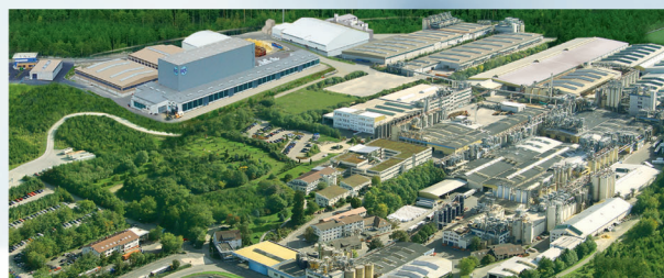
SAFE® Plant Bedding & Enrichment, Germany

All by-products are fully processed and no material waste is generated during the whole production process!