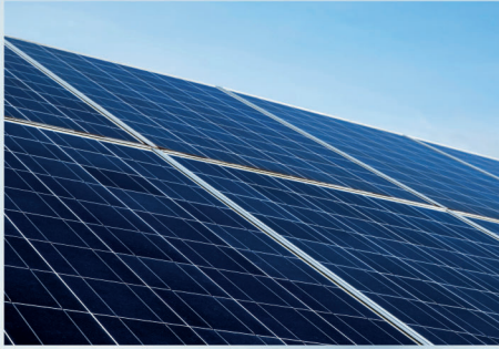
Photovoltaic at SAFE® Diets (France)

SAFE® is taking advantage of the many opportunities offered by alternative energies and thereby reducing its dependence on fossil fuels. A dedicated biomass power plant for electricity generation has been installed at the Rosenberg site in Germany, which saves 13,000 tons of CO 2 annually. The heat generated here is used for the drying process of the bedding production.