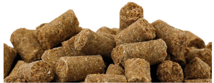
SAFE® E8220 Version 232