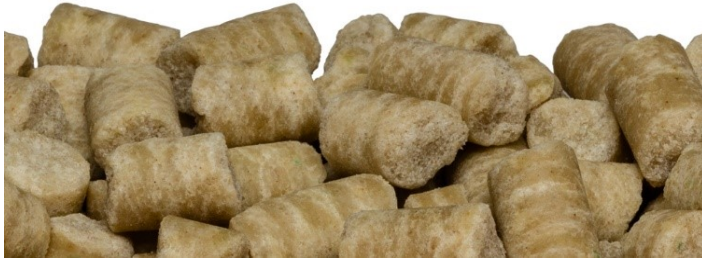
SAFE® U8955 Version 2