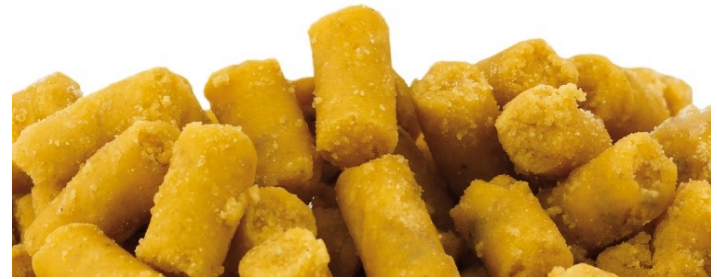
SAFE® U8978 Version 76