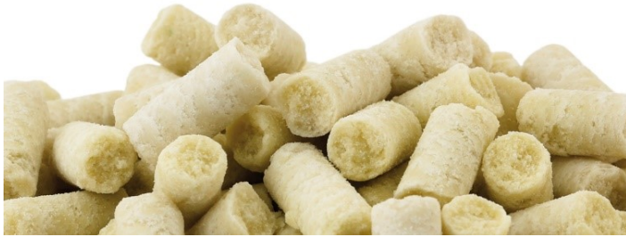
SAFE® U8978 Version 198